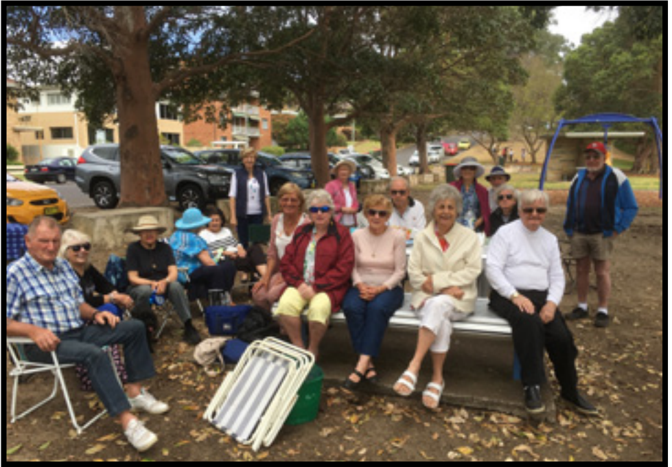
Above: Henry Kendall Square Dance Club Picnic