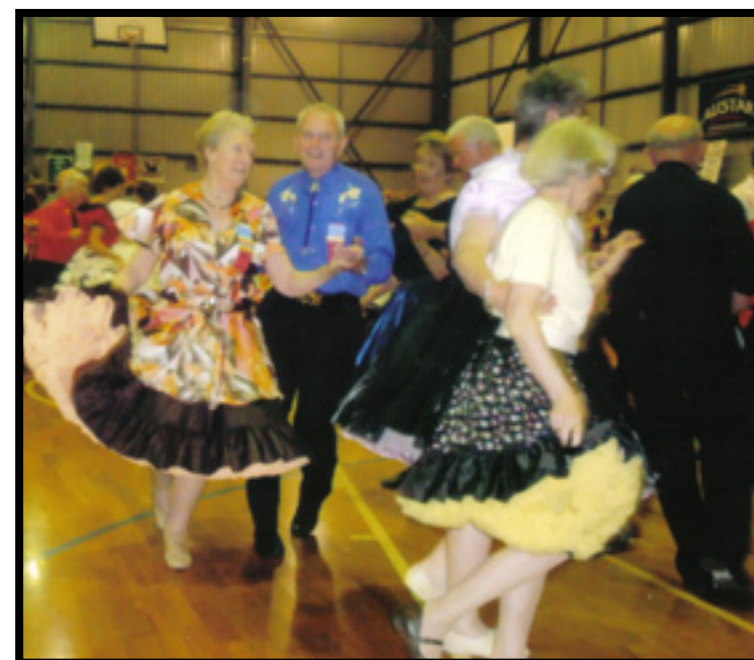
Below: 32nd NSW Convention