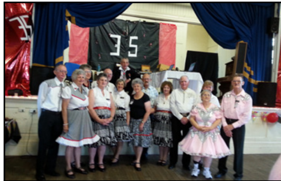
Above: Glenn Square Final Dance 2016

The opinions expressed in Let's Go Dancing are those of individual contributors and may not necessarily agree with the opinions of the editor or of SARDA NSW, nor are we responsible for any goods advertised for sale.