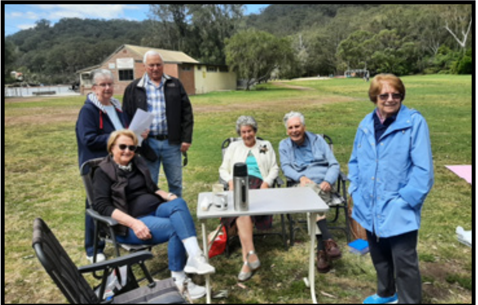
Below: Knee Deep Squares Picnic