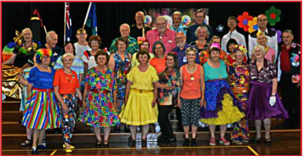
Mountain Devils 27th Birthday