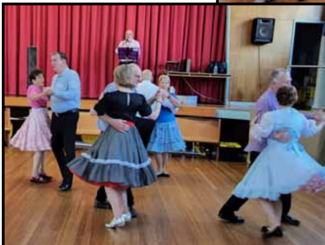
Guys and Dolls