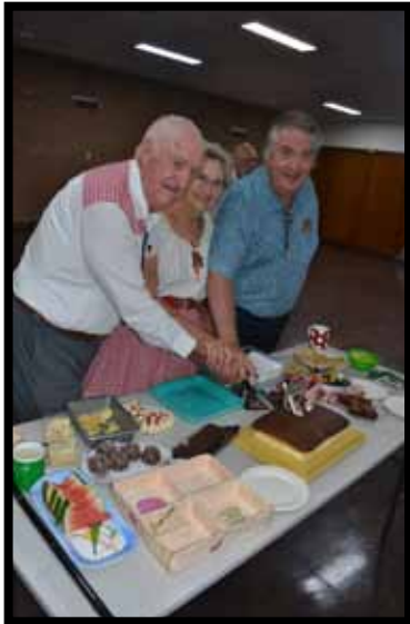
Carpenter & Co 44th Birthday