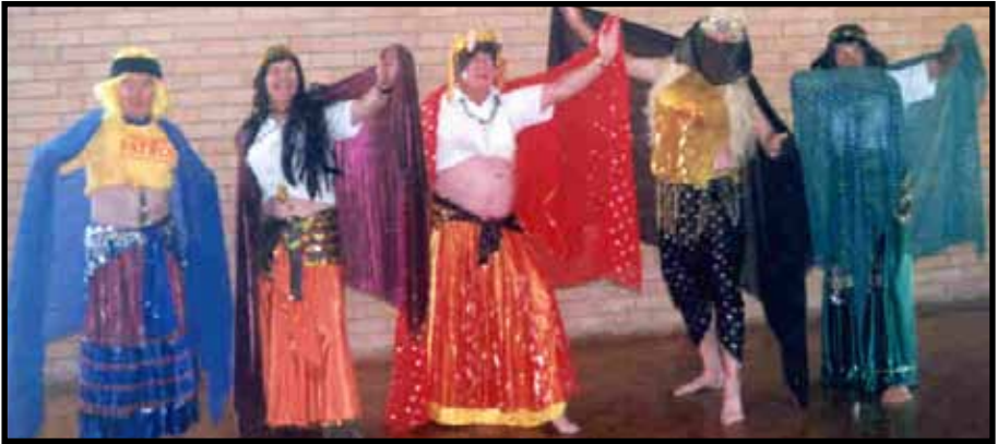
Spring Swing 2013