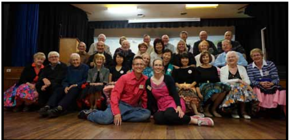
Hillbillies August 2017