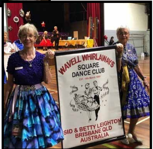
Wavell Whirlaways celebrating 54years