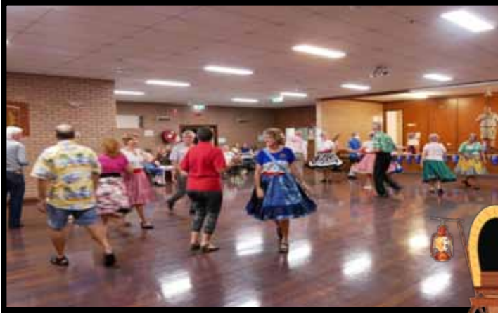
Carpenter & Co first night back