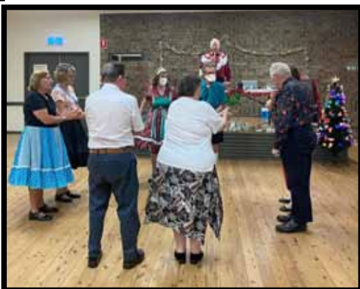
A1 Christmas Dance