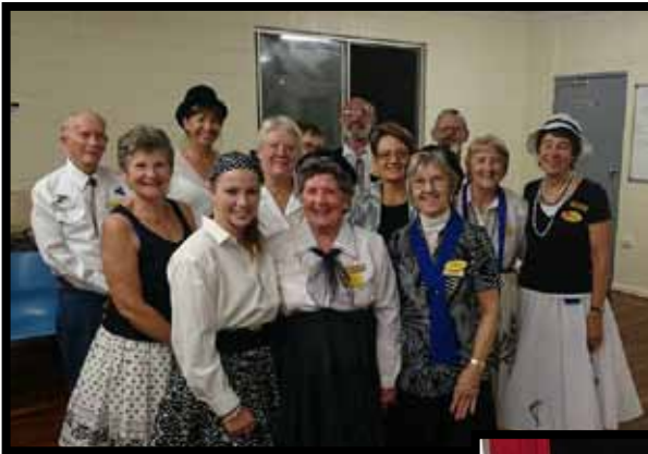
Cane Country celebrating 40 years in March