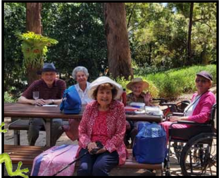
Knee Deep Squares Picnic