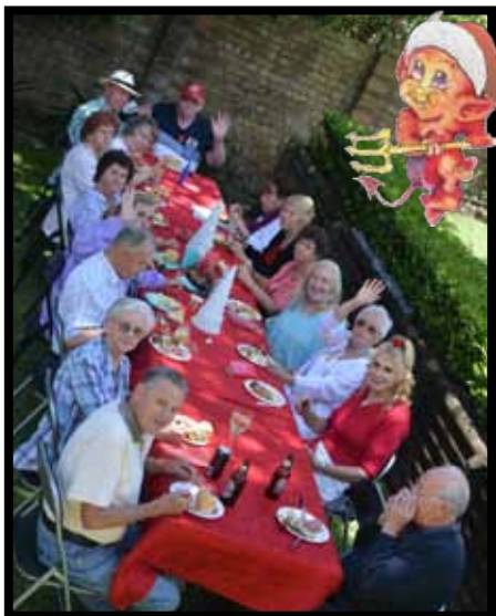
Lunch at the Todd Residence