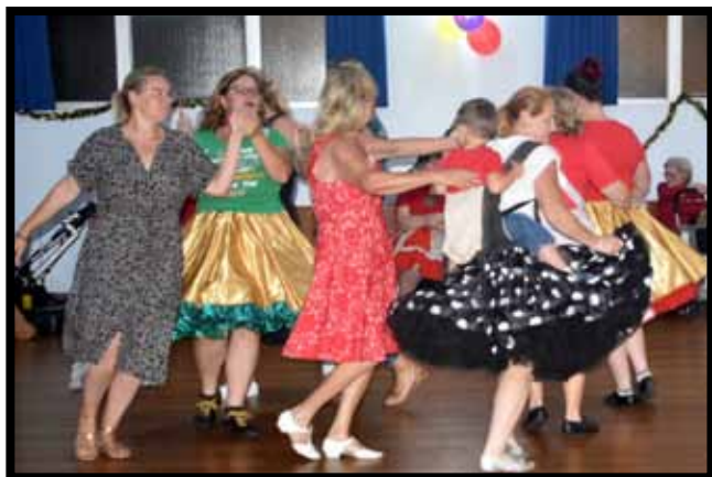
Dancing at Guys & Dolls