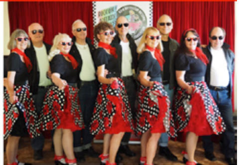
Committee Dressed Set

Get 4 couples together and form a dressed set. Let the committee know by the end of February and we'll add you to the list.