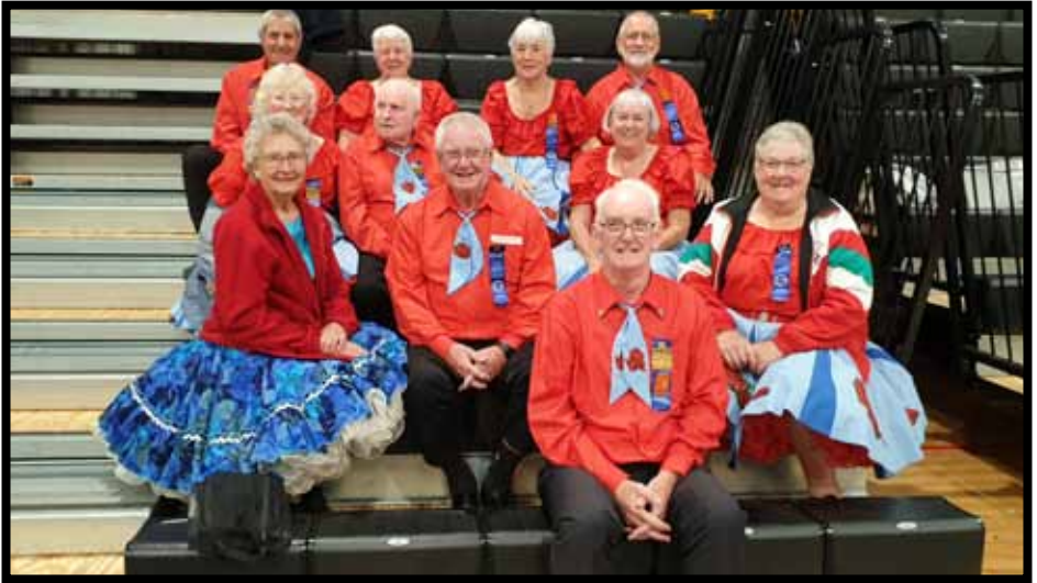
TAWS Group at the 62nd National Convention at Goulburn