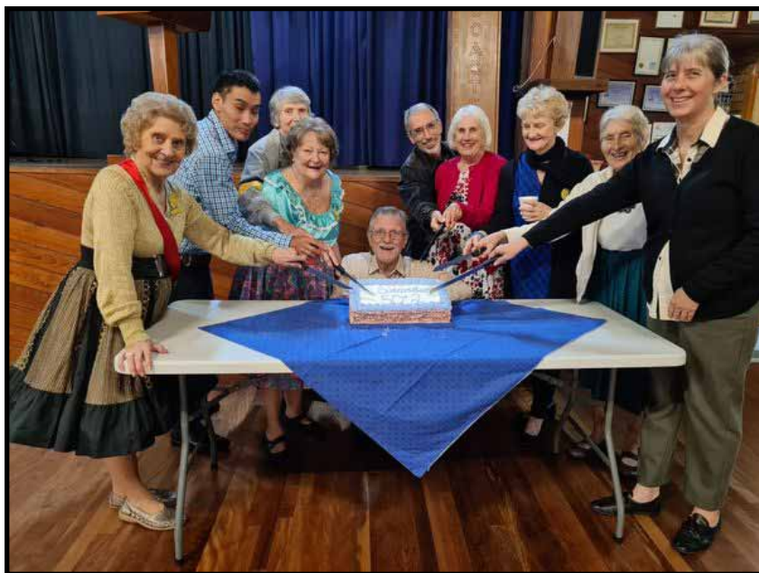
Suncoasters celebrating 52 years of dancing