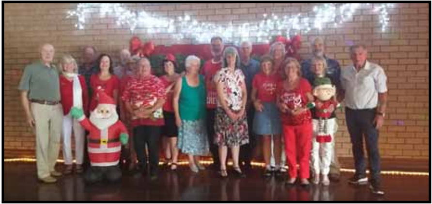
PELICAN PROMENADERS CHRISTMAS DANCE