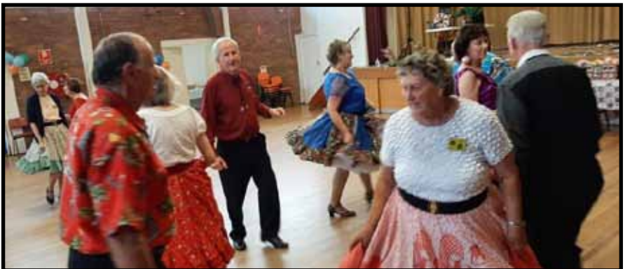
KNEE DEEP SQUARES CHRISTMAS DANCE