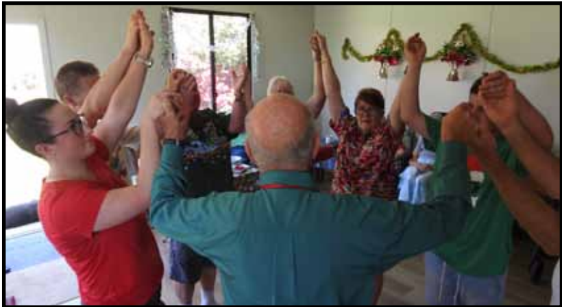
SUSSEX SHOALHAVEN CHRISTMAS DANCE