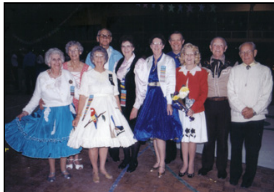
Life Members 2000