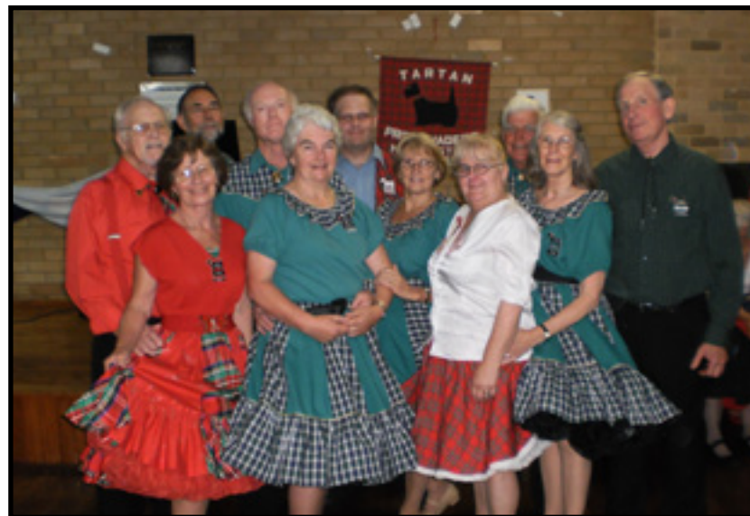
Hunter Valley 2011

The opinions expressed in Let's Go Dancing are those of individual contributors and may not necessarily agree with the opinions of the editor or of SARDA NSW, nor are we responsible for any goods advertised for sale.