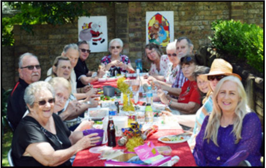
Mountain Devils Christmas Picnic