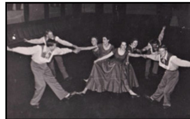
Below: The Olympian Square Dance Set bowing.