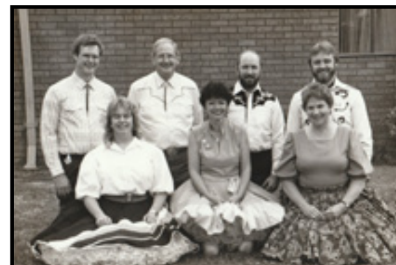
Recognise any of these people?