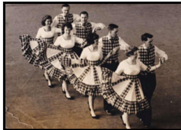
Above: Promenading out at the 5th National Square Dance Convention in 1964 - the first to be held in Melbourne.

The opinions expressed in Let's Go Dancing are those of individual contributors and may not necessarily agree with the opinions of the editor or of SARDA NSW, nor are we responsible for any goods advertised for sale.